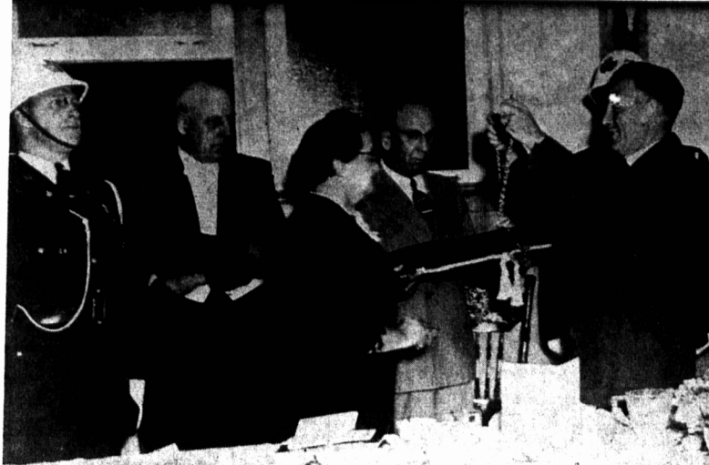
KEY PRESENTED TO CWL NATIONAL PRESIDENT