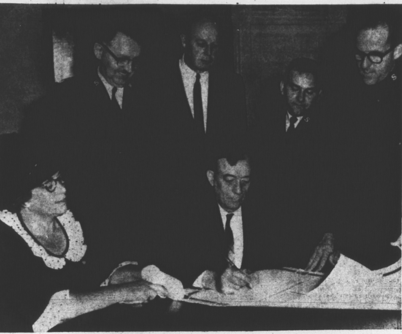
ACTING PREMIER SIGNS SALVATION ARMY SCROLL