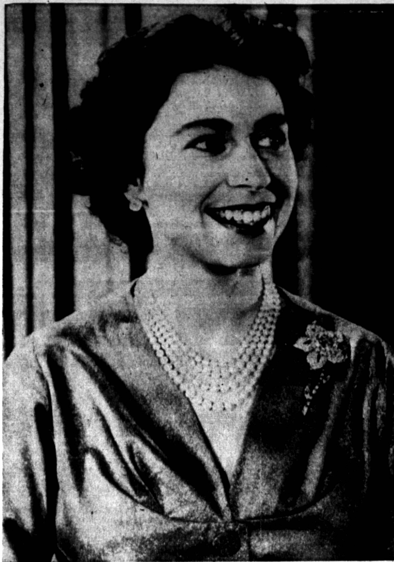
CANADIANS SAW A BRILLIANT QUEEN