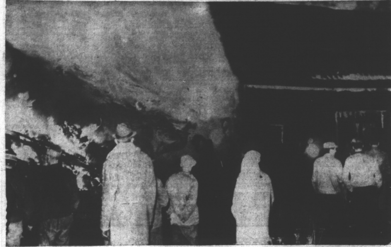
THE LARGE PILE of burning material on the left is all that remains of a 23 by 45-foot barn on the farm of Earl Ings, Mount Herbert as the result of a fire last evening. Here the firemen concentrate their efforts on saving the adjoining barn on the right as flames start to appear through the roof. The end of the 32 by 65 foot structure is hidden by smoke.

Both times the Western controllers served notice Western commercial and military planes would be flying the corridors as usual.