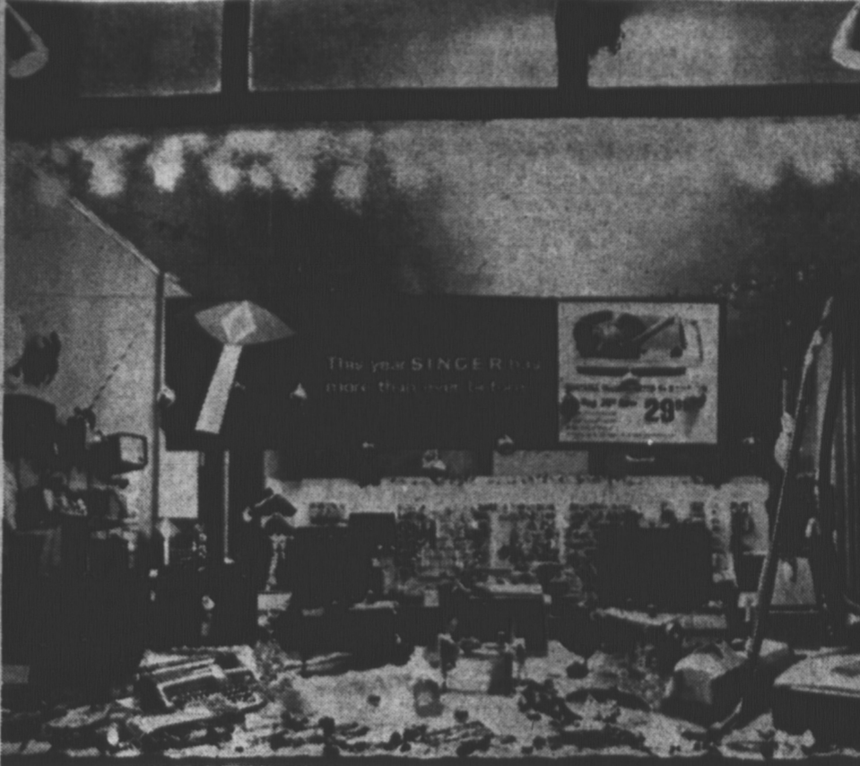
Pictured above is the excellent array of gifts displayed in the window of Singer Sewing Centre.