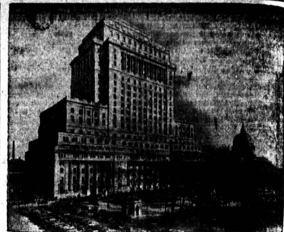
The following Representatives of the Sun Life of Canada in Prince Edward Island will be glad to discuss with you any matters relating to life insurance or annuities, without obligation.

The Grand Falls on the Hamilton river in Labrador are estimated to have a potential 1,250,000 horsepower.