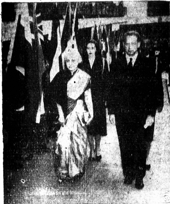
Madame V. L. Pandit, President of the UN General Assembly, and Dag Hammarskjöld, Secretary General of the UN, walk past the rows of flags of member nations. It was the UN's eighth birthday celebration. Thousands of visitors watched celebrities and diplomats take part in the open air ceremonies.