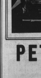
PETER D'ADAMO RESTAURANT