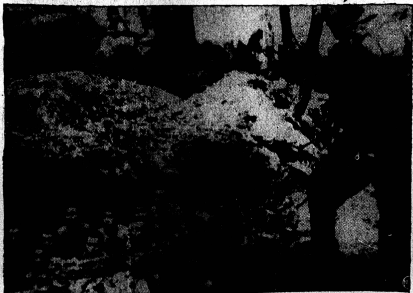
"HARE" TRAP —An American Marine stands guard over stripped North Korean prisoners (in circular dugout) on Wolmi Island, off Inchon. Late dispatches told of the capture of Kimpo airfield, 10 miles west of Seoul, by American troops.