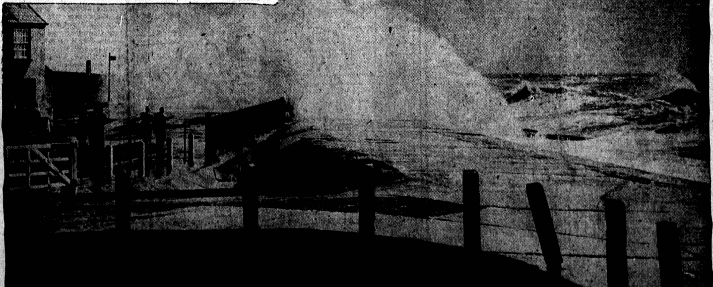
Huge waves break over road along sea front at Seaford, Sussex, during the worst gale to lash Britain in 25 years. Reaching a speed of 82 miles-an-hour, it was the tall end of a cyclone that battered shipping in the Atlantic. Small craft were smashed, sea walls hammered, a pleasure steamer sunk, repair installations damaged, steel plates of a towed liner ripped by force of gale. Dredger at Southampton blown overboard, drowned.