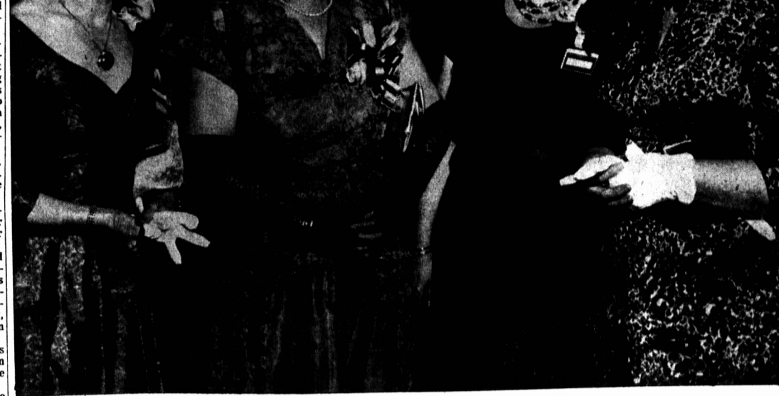
LIBERAL WOMEN MEET AT OTTAWA