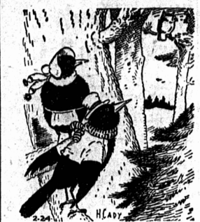
"Hooty the Owl!" she exclaimed under her breath.

Blacky the Crow had somehow managed to stay around in spite of all the hardships. How he got enough to eat only he and Mrs. Blacky knew.