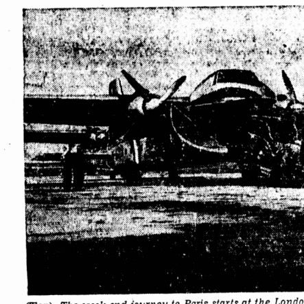
(Top) The week-end journey to Paris starts at the London hotel. (Above) The taxis at the open doors to the hold of the "Bristol" freighter. Passengers travel in a cabin at the rear of the plane.