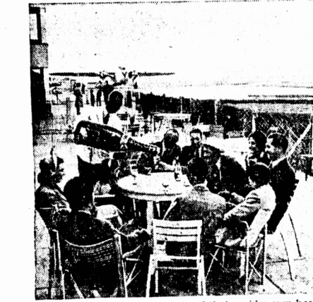
(Left) Passengers and their guides-cum-hosts enjoy a drink on the veranda of the restaurant at Le Touquet Airport. (Right) One of the taxis passes a Paris 'façade' on the Quai D'Orsay while on a sightseeing tour.