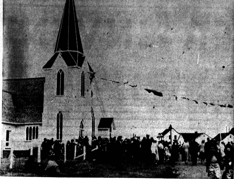
A part of the crowd which visited Lennox Island yesterday in the vicinity of the church which is the place of worship for the 40 Indian families who live on the island.