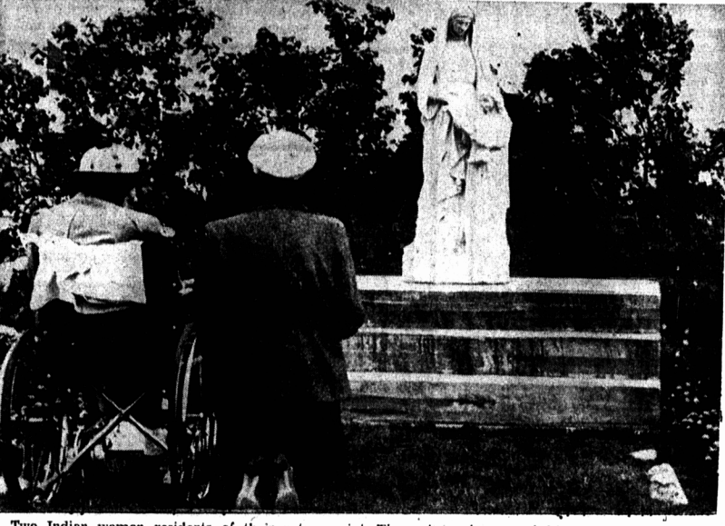
Two Indian women residents of their patron saint. The shrine is located on the grounds of the Lennox Island are seen yesterday in prayer before the shrine erected in 1953 in honor of Saint Anne, parochial house and in this vicinity outdoor religious observances.