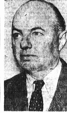
Mitchell Hepburn, former Premier of Ontario, says his 250 hogs require only two man-hours of work a day.

High tide today at Charlottetown at 5.18 a.m. and 5.52 p.m. High tide and the North Shore at 12.17 a.m. and 1.00 p.m. Sun rises today at 4.25 a.m. and sets at 8.01 p.m.