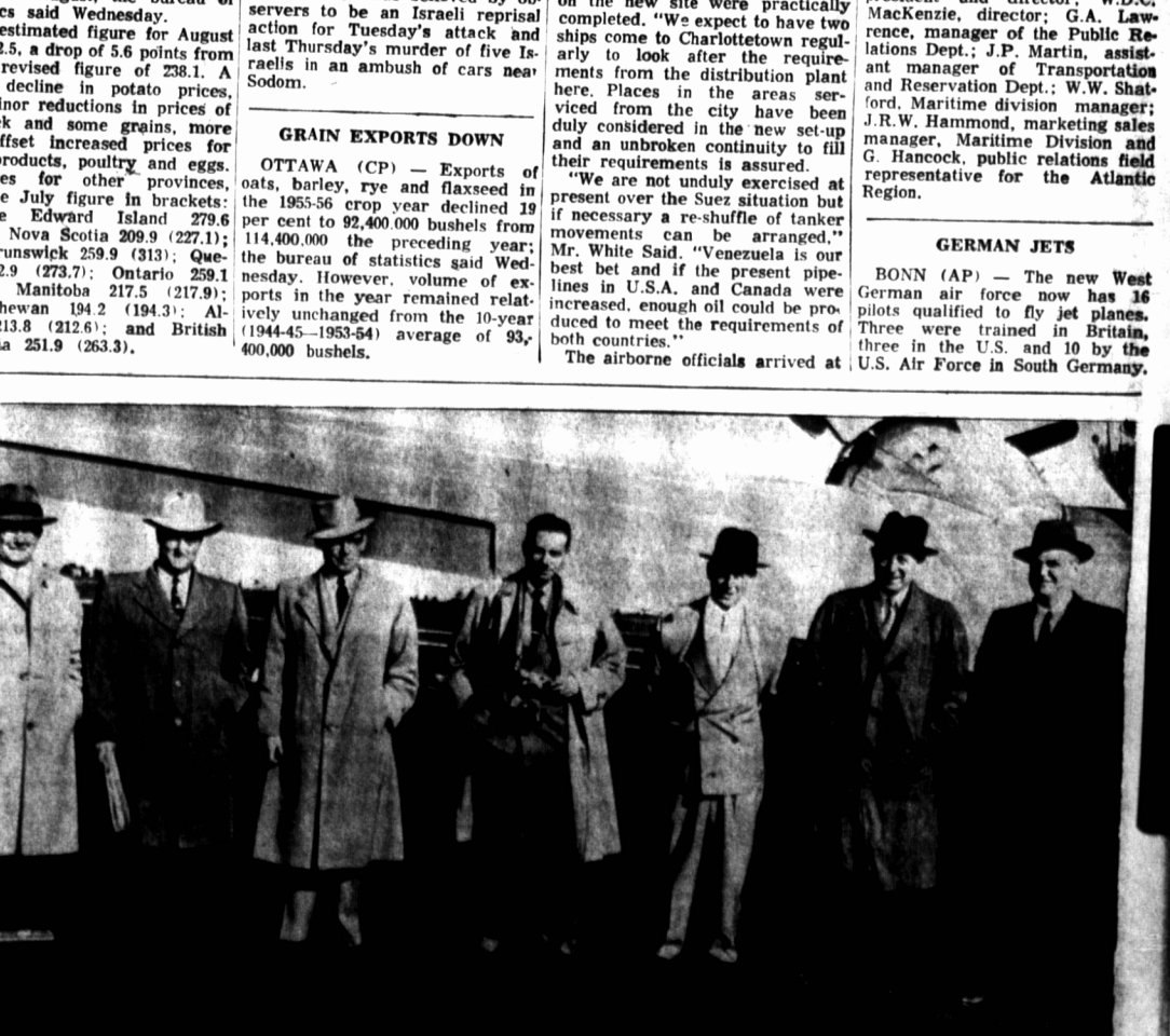
IMPERIAL OIL COMPANY OFFICIALS ON TOUR

OTTAWA (CP) — Prime Minister St. Laurent will address a national conference of business, industry and universities here next month. Mr. St. Laurent will speak at the opening banquet of the three-day conference called for Nov. 12-14 by the National Conference of Canadian Universities to discuss problems facing universities in the next 10 years.