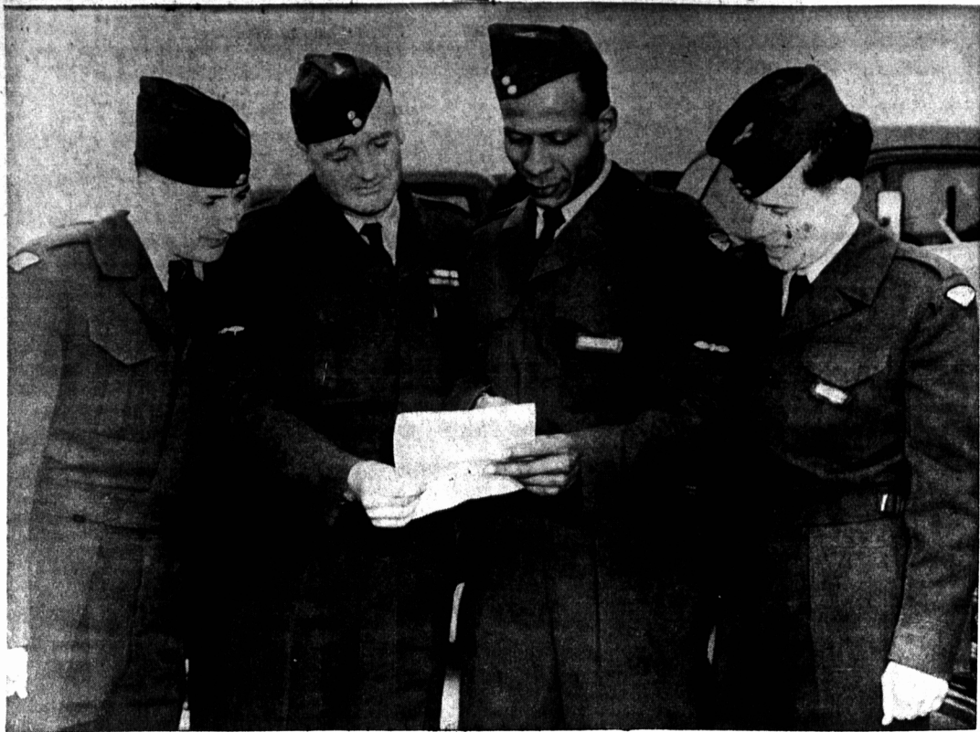
JUST RECEIVED PASS MARKS

Whoopee we made it! Four happy trainees at RCAF Station Aylmer, Ontario from New Brunswick, P.E.I. and Quebec, have just received their marks