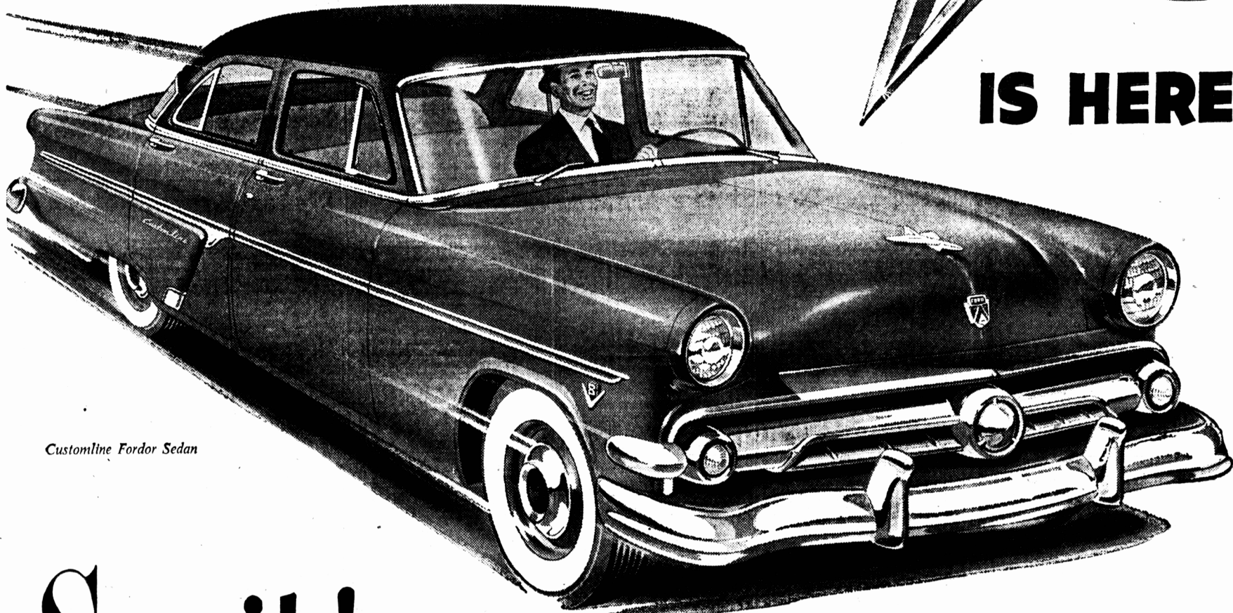
Customline Fordor Sedan