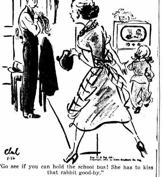
"Go see if you can hold the school bus! She has to kiss that rabbit good-by."