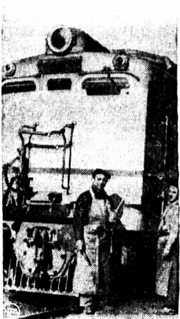
"CANNED" RAIL ROADING — The Siaz-Gafsa Railroad Company, which operates through the desert country of southern Tunisia, has taken steps to protect its trainmen from attacks by bands of nomads. Trainmen have been issued automatic rifles, and cabs of the diesel motors have been armored, as above, leaving only peep-hole space for sighting along the right of way.