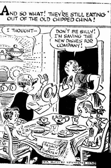
AND SO WHAT! THEY'RE STILL EATING OUT OF THE OLD CHIPPED CHINA!