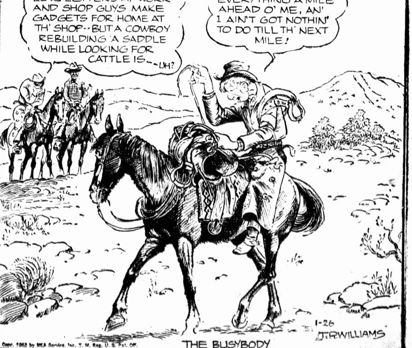
STENOGRAPHERS WRITE LOVE LETTERS AT WORK AND SHOP GUYS MAKE GADGETS FOR HOME AT TH' SHOP—BUT A COWBOY REBUILDING A SADDLE WHILE LOOKING FOR CATTLE IS—UH?