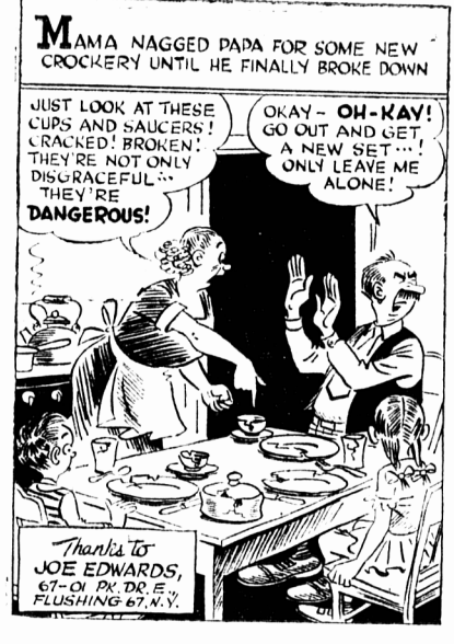
MAMA NAGGED PAPA FOR SOME NEW CROCKERY UNTIL HE FINALLY BROKE DOWN