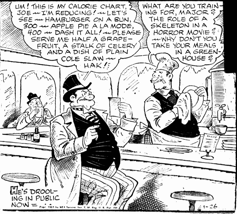
HE'S DROOLING IN PUBLIC NOW =