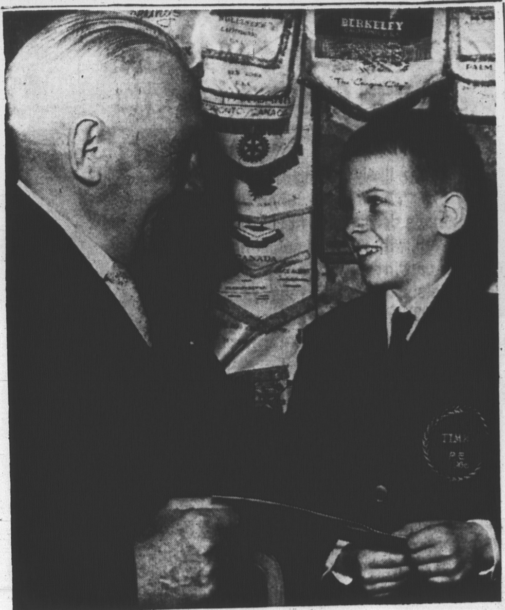
LT-GOVERNOR BUYS FIRST SEALS