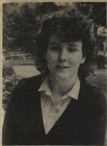
by Inge Dorsey