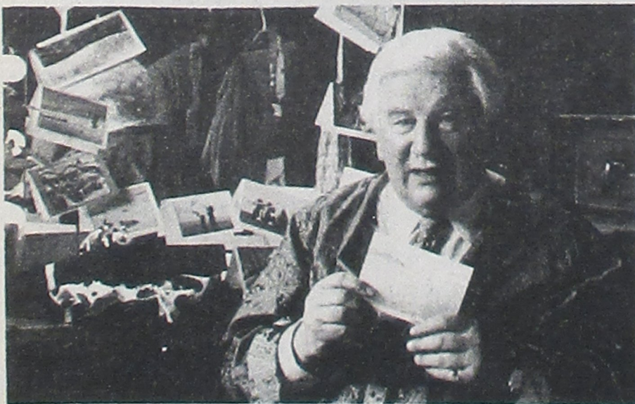
Sir Peter Ustinov, UNICEF Goodwill Ambassador

"This Holiday Season, send UNICEF cards!"