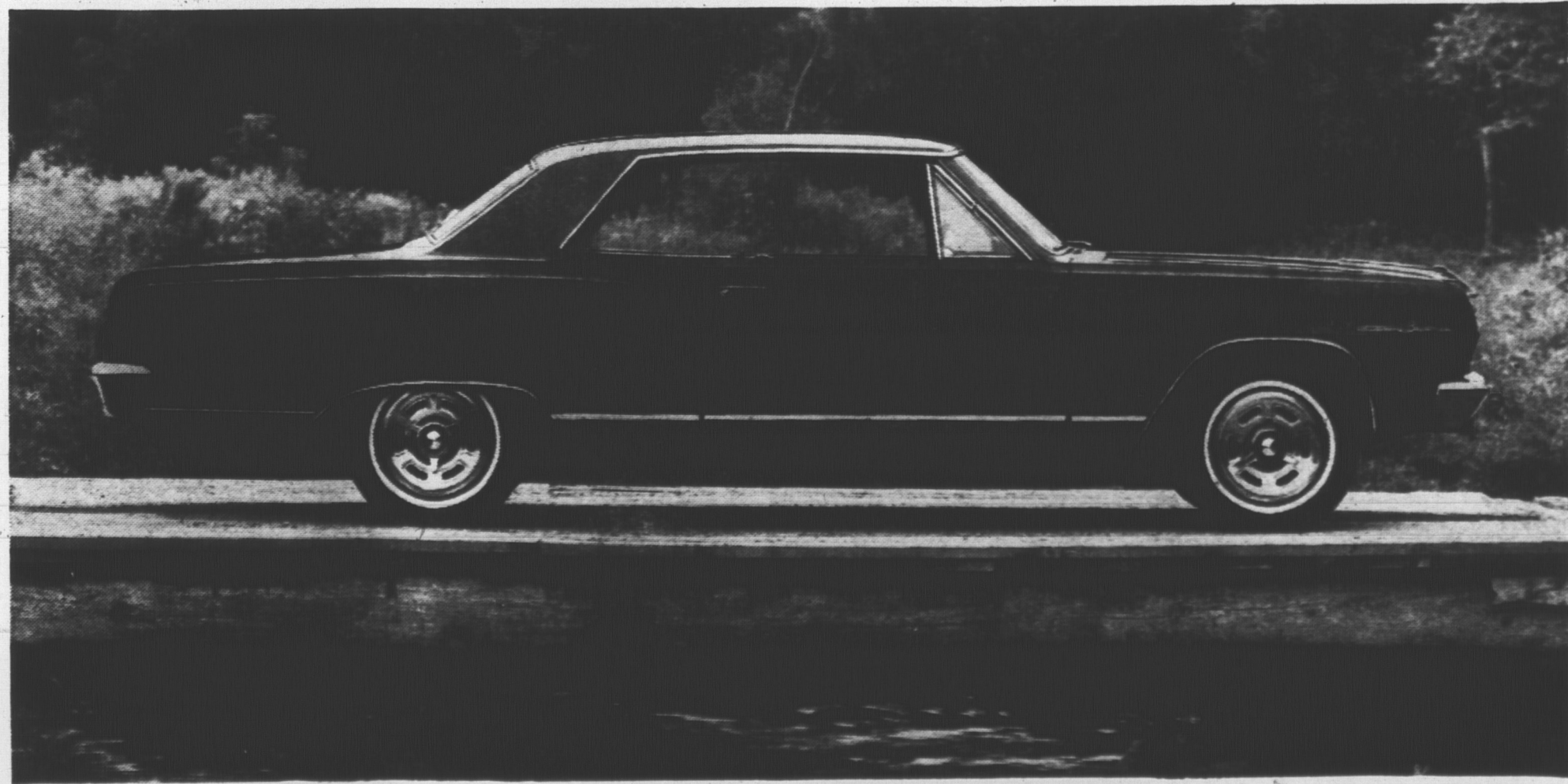
A GENERAL MOTORS VALUE