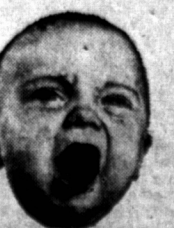
LOOK AT THE SPOT I'M IN

He left abruptly, walking briskly into the jockey room like a fellow who was going to take a quick shower and be right back. Yet in a few minutes he would be risking life and limb in a race which would mean $7,000 to him if his horse won. These little guys have all the nerve in the world, but no nerves.