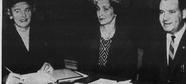
SOME MEMBERS of the eight-member committee formed to investigate clearing up of Charlottetown harbor pollution are seen at a public meeting in Spring Park School last evening. Among various topics under discussion was the harbor survey to be conducted this summer by city and provincial governments.