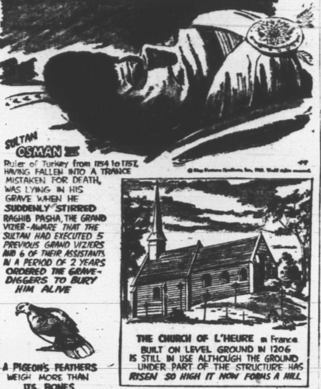
A PIGEON'S FEATHERS WEIGH MORE THAN ITS BONES.