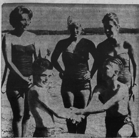
STUDENTS DEMONSTRATE KNOWLEDGE