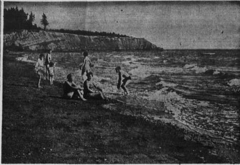
An Island Paradise to every tourist who likes the beach... who likes swimming... for here in P.E.I. are situated many of the finest beaches in North America, with waters known to be the warmest north of Florida. No trip to the Island is complete without a trip to any of these beaches.