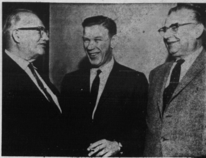
AT LIVESTOCK PRODUCERS' DAY