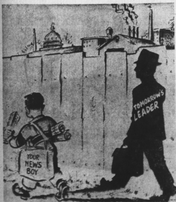
FUTURE CASTS ITS SHADOW

"You have already proven your ability and willingness to be a part of your community. I know your abilities will continue to grow with the years. The country depends on the industry of young citizens like you, now and in the years to come. I extend best wishes for your continued success and happiness."