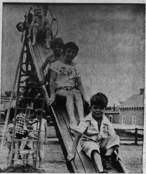
S'SIDE PLAYGROUNDS ARE POPULAR

SUMMERSIDE — With the discovery of an attempted break at Crockett's Jewellery Store on Water Street yesterday morning, it appears that thieves very active in the town over the weekend. Sunday an attempted break was discovered at the Jewellery Store on Central Street and also a break at the Capitol Theatre on Central Street. The intruders there netted the intruders well over $500 from the safe. It is believed the attempted break at the jewellery store occurred late Sunday night with thieves trying to gain access to the building by entering an alleyway between the Royal Bank and the Jewellery store. Several iron bars over the office window were torn away and an attempt was made to remove a fan from the air vent. The alleyway between the two buildings is also blocked at both ends, at one end with a heavy cement wall and at the north end by a steel gate. The thieves had to climb the gate in order to get into the alley. Police reported last night that no new leads have been uncovered regarding the three breaks.