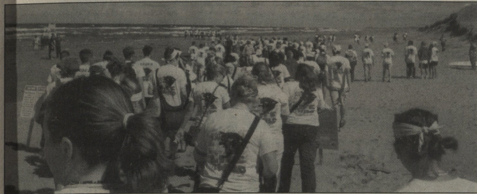
NSO at the beach.

Mullets, hotdogs, Shinerama, weird noises, Lamas (that's right - only one "I"), an old lady in tights, guys in dresses, rubber chicken flinging, Brackley Beach in the cold, New Kids on the Block impersonators, sour kraut, dog food, chants, and cheers: These are just a few memories that stand out from my experience with New Student Orientation 2001 (NSO). Of course, I could talk about the great things we accomplished this year: an inviting atmosphere for new students, $6600 raised for cystic fibrosis, and many new friendships blossoming in the breeze. But that's only a small part of what NSO was all about.