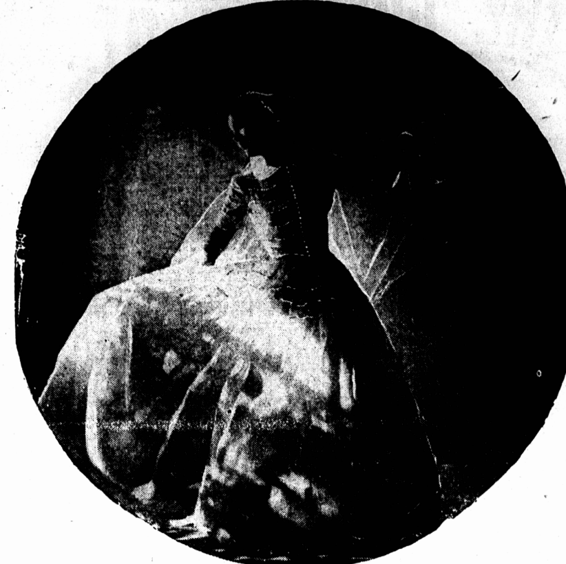
You can combine the modern and the traditional in such a gown. It has a fitted bodice with the new rising neckline and dipping waistline. The sleeves are long, tapering to points. The train is modified in the modern manner and flows from wide panels in the back of the skirt. These simple, elegant lines are enhanced when you choose a fabric such as crisp frosted organdy. The dress can also be made with a sweetheart neckline in the formal or daytime versions.

Gowns for the bride maids are very similar to the bride's. Trails and demure necklines are dispensed with. The attendant can go sleeveless though the bride wears sleeves. There's a charming day-length gown with short sleeves and a sweetheart neckline that either the informal bride or bridesmaids can wear. This dress can also be worn after the wedding without any change whatsoever. The fabrics to choose for a spring ceremony are most varied. If you've always wanted to be married in satin or lace you can still do it. If on the other hand, you see the charm of a cotton wedding you can make a lovely picture in frosted or plain organdy, plique or voile. You might even want to really be different and choose a nylon fabric Rayon taffeta, sheer crepes and chiffon make memorable gowns.