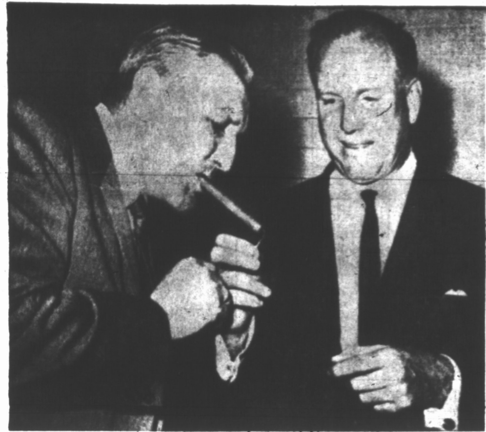
RED WINGS OWNER AND COACH

A mighty pleased Bruce Norris, right, owner of the Detroit Red Wings, lights a cigar for coach Sid Abel as he extends the V.I.P. treatment after the Red Wings beat the New York Rangers 7-4 Thursday night to clinch the National Hockey League championship.