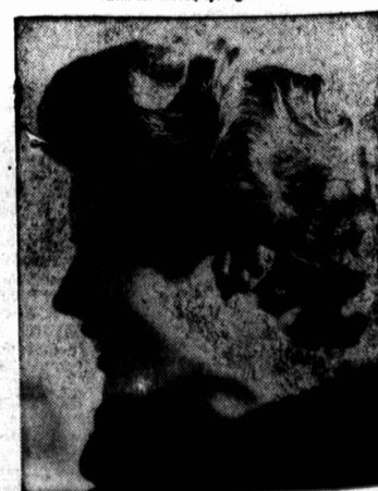
The easiest Pincurl Method of all... with the prettiest results!