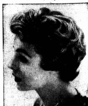
The most satisfactory On-Curler Method of all... with the nicest, springiest curls!