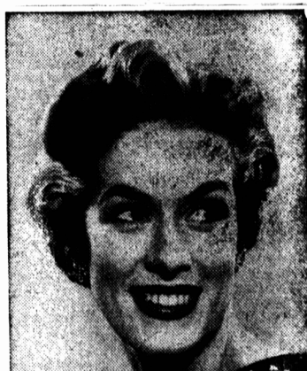
The most beautiful Salon Method permanent of all... with firmest, lasting curls!

RICHARD HUDNUT all-new home permanent with beauty rinse neutralizer guarantees best results whichever method you use.