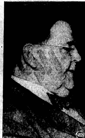
TRANSPORT HEAD? — Informed circles in Washington say that Charles Van Horn, retired railroad executive, will head the common-to-be-created transportation office within the Department of Defense. Van Horn was formerly associated with the Baltimore and Ohio railroad.

TOKYO, Aug. 24 (Thursday)—Persistent day and night flanking attempts by North Korean forces to open a hole for 50,000 Reds massed for an all-out assault on Taegu failed Wednesday for the fourth straight time. Determined counter-attacks by American-South Korean forces including unidentified new U. S. units in the line—halted Red infiltrators who penetrated 4,000-foot ridges at some points to within eight miles of Taegu. American artillery, tanks and planes backed up the defence line. Should the Reds find a weak spot, they could pour the bulk of a five-division, 80,000-man, striking force through the hole. The Communists also had built up a two-division concentration near Kosong to the south at the southern end of the 120-mile-long battle perimeter. But here, as on the other end of the line near the allied-held east coast port of Pohang, the action was subordinated by the critical Taegu fighting. Hour-by-hour tension mounted on the north-central Taegu sector as signs increased that the Reds hoped to crumple ahead with an all-out drive for the key city. Latest front dispatches said attempts of some 1,500 Reds to blast