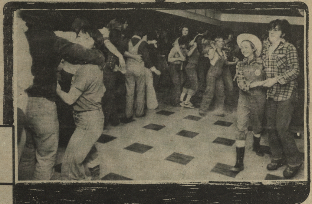
BARN BECOMES LOGICAL CHOICE FOR BARN DANCE... STUDENTS FIND REVERTING TO HICKISH BEHAVIOR COMES NATURALLY