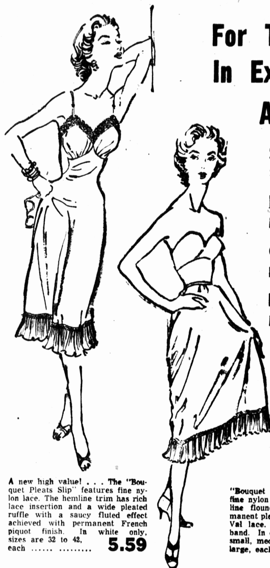
A new high value! . . . The "Bouquet Pleats Slip" features fine nylon lace. The hemline trim has rich lace insertion and a wide pleated ruffe with a saucy fluted effect achieved with permanent French piquet finish. In white only. sizes are 32 to 42. each . . . . . 5.59