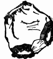
"Bouquet Pleats Briefs" of fine nylon tricot with pleated insert on front of opening edged with imported French Val lace. Encased elastic waistband. Colors red, mauve or white. sizes small, medium or large. a pair . . . . . 1.99

Nationally Famous Lingerie For The JUNE BRIDE and Others In Exquisite Match-Mated Styles AT SPECIAL LOW PRICES