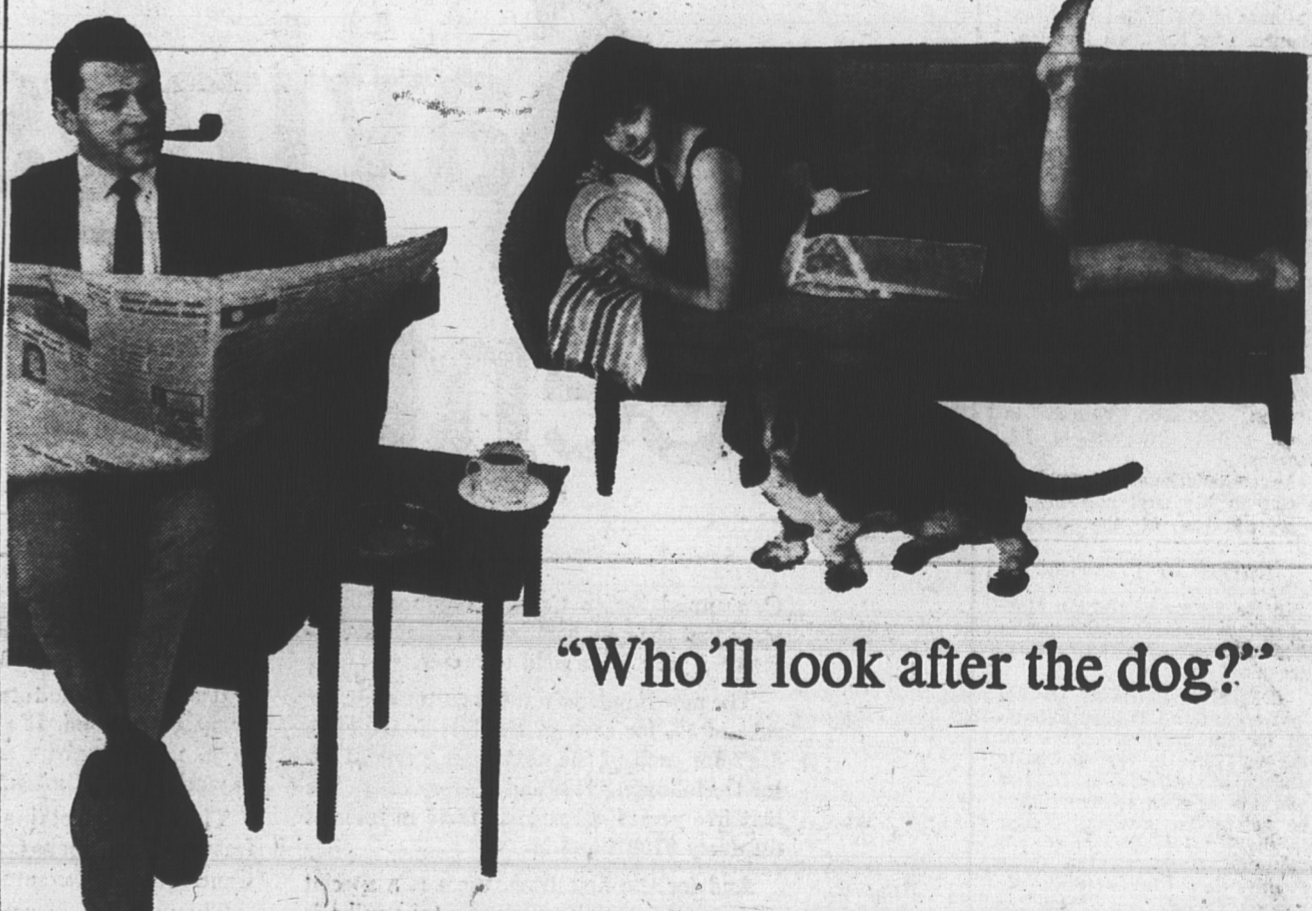
"Who'll look after the dog?"

"Mother said she'll baby sit. I don't have to be here when the T.V. repairman comes. Your Mom and Dad aren't coming over till next week. Now, give me one good reason why I can't fly Air Canada with you on your business trip."