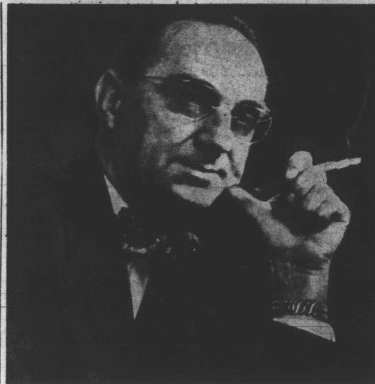
PREMIER SMALLWOOD IS WINNER AT POLLS

ST. JOHN'S, Nfld. (CP)—Premier Joseph Smallwood led his Liberal government to its fourth big election victory since Confederation Thursday night and apparently smashed a bid by organized labor to get its foot in the province's political door.