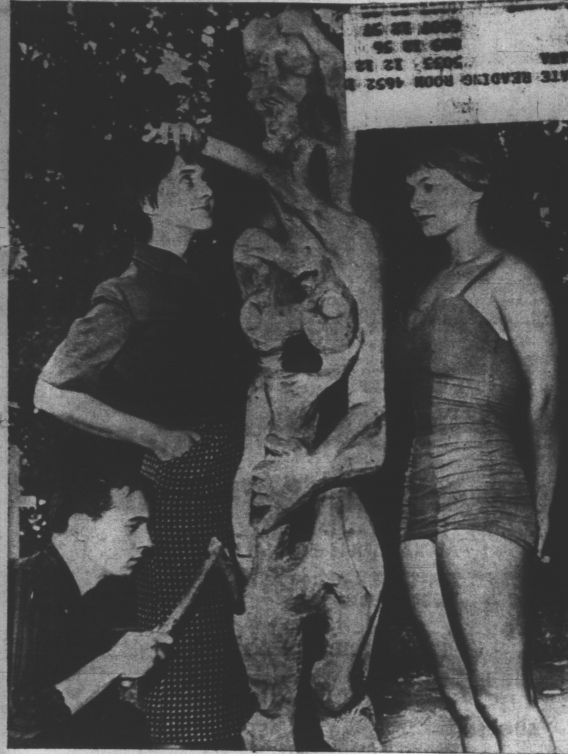
HUMAN FORM IN TWISTED HEMLOCK

About a dozen fires, believed to have been set on purpose, have broken out around the ships and pier.