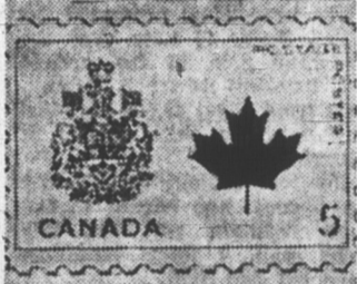
COAT OF ARMS STAMP

A Coat of Arms stamp, 14th and final release in a pre-centennial floral emblem series inaugurated in 1964 to honour the provinces and territories, will be released on June 30, the eve of Canada's 99th birthday. Postmaster General Jean-Pierre Cote has announced.