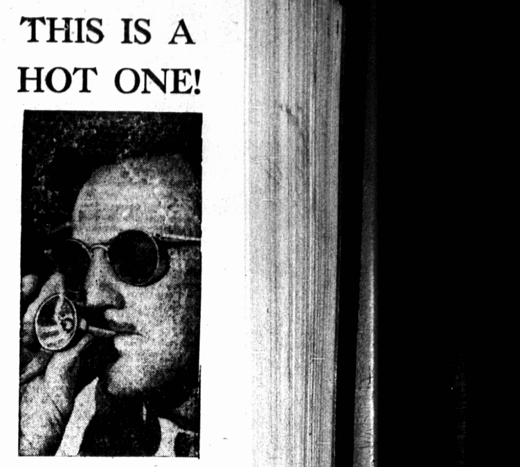
Mirror is mounted in gimbal ring so the polar axis of mounting is parallel to the earth's. Mirror moves in synchronization with sun's movement.