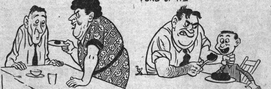
PUT WHAT WITH DIET FADS AND THE PRICE OF MEAT... WE ARE AT TIMES FORCED TO EAT THINGS WE DON'T LIKE