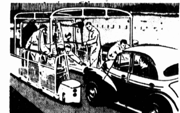
Mobile Dry Dock was specifically built for non-stop test. When car entered dock both vehicles synchronized their speeds. Workmen fueled and serviced test car while driving crews were changed.

smoothly as the day it came off the assembly line. During 224 hours of continuous turns on the circular track (turns required extra power equal to climbing 66 miles) gas consumption averaged 43 miles per gallon!