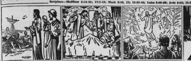
Andrew, Peter, James and John leave their boats and nets and follow Christ to become fishers of men and the first disciples.—Matthew 4:18-22.

MEMORY VERSE:—"For we cannot but speak of the things which we have seen and heard."—Acts 4:20.