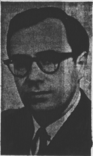
Mark MacGuigan Queens