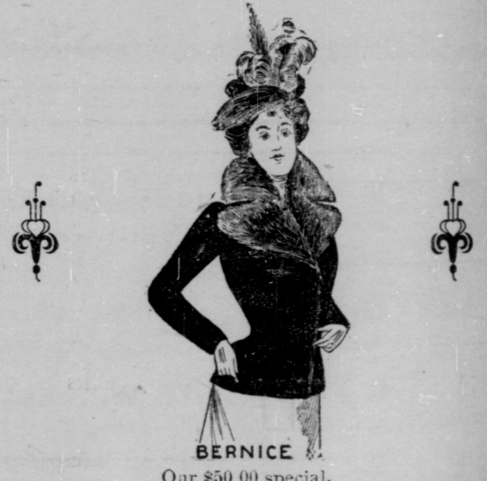
BERNICE Our $50.00 special.

$6.50, $7.25, $8.50. These are good grades of Beaver, Melton and President cloth. Our prices $9, $9.75, $10.50, $11.75, $44, $15 are prime Meltons, Beavers, Whipcords, Chinchille and Cheviot. We fit you every time, or your money back, without us having a fit.