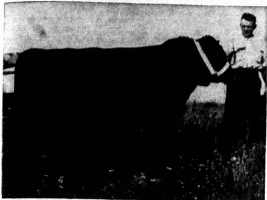
STERLING WOOD, Mt. Herbert is shown holding Watermead Air Plot the junior and reserve grand champion beef bull at the Short-horn Field Day.