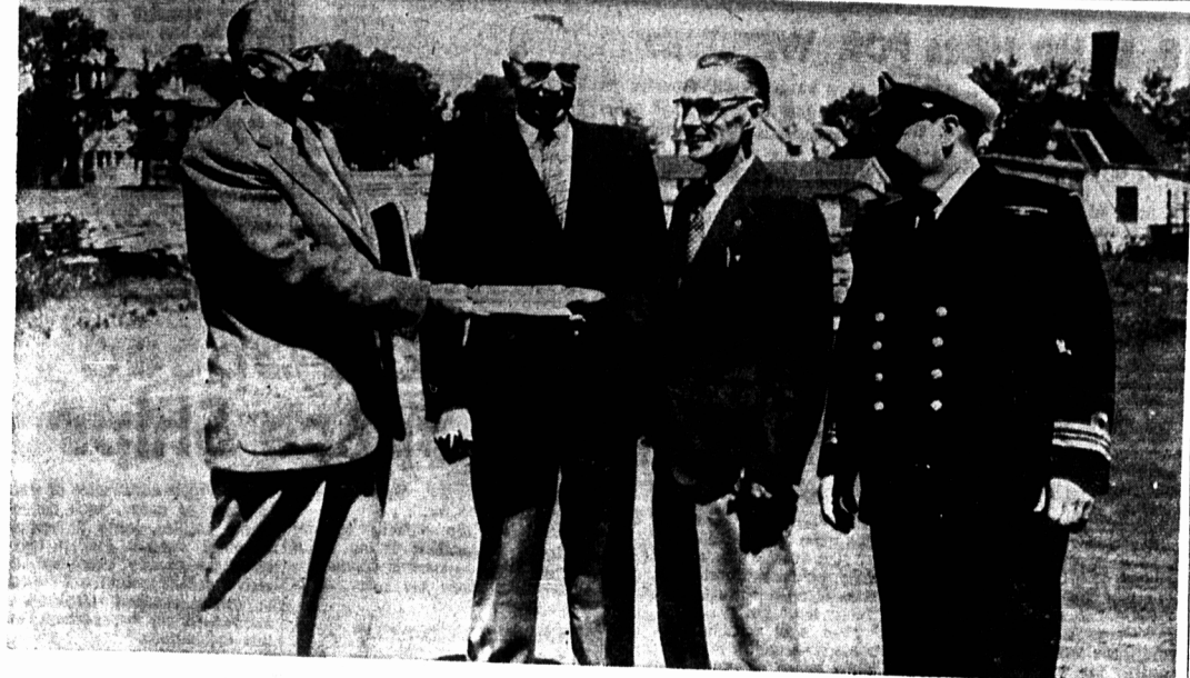
NEW NAVAL BARRACKS SITE PURCHASED