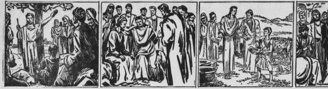
John the Baptist gives witness to Jesus as the Son of God and Lamb of God. John's disciples turn and follow Him—John 1:34, 35-37.

Scripture—Mark 3:14-19; John 1:28-31; 6:14-15; 12:20-23; 14:1-12; Acts 1:18.