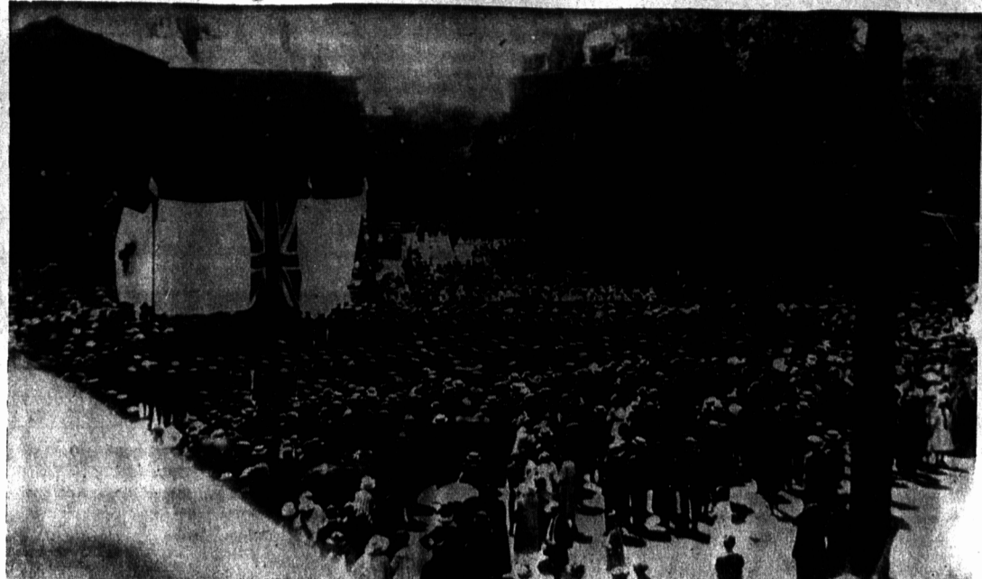
SCENE AT WAR MONUMENT UNVEILING, 1925