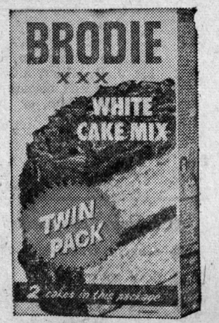
In the YELLOW package with the big RED letters

WHITE • CHOCOLATE • COMBINATION • SPICE • ORANGE